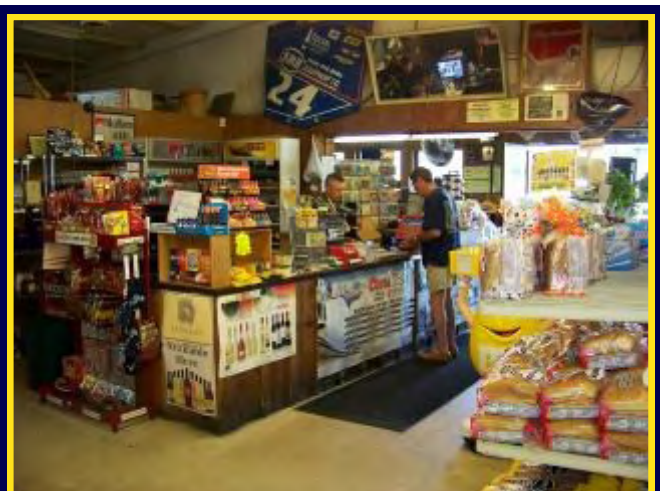
CHECK OUT COUNTER