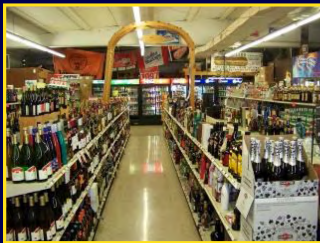
WELL-STOCKED LIQUOR AISLES