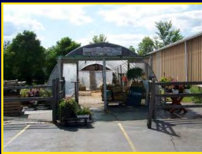
GREENHOUSE ADJACENT TO BUILDING SOUTH SIDE