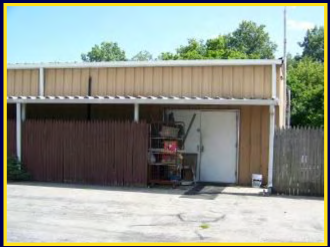
DOUBLE DOORS ON NE CORNER OF BUILDING