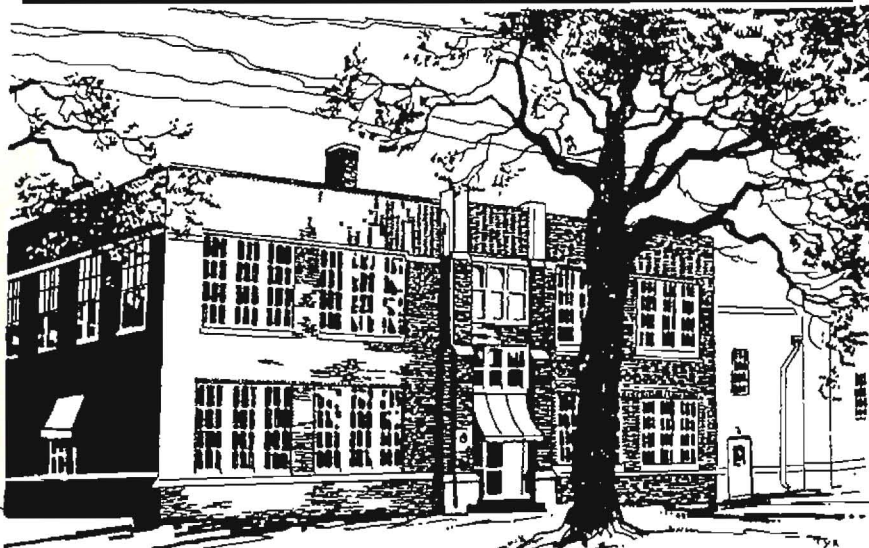
Old Schoolhouse Commons Lambertville, Michigan