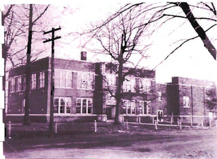
Lambertville High School