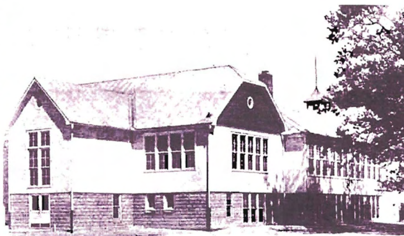
Temperance High School

Both Lambertville High School and Temperance High School had their first 12th graduation in 1923 and the last in 1946. On 01 Jun 1946, Bedford Township voters approved reorganization into a rural agricultural school. At the first meeting of the new Board of Education on 15 Jun 1946, it was decided the name of the school would be the Bedford Rural Agricultural School. In 1955 the name was changed to Bedford Public School.