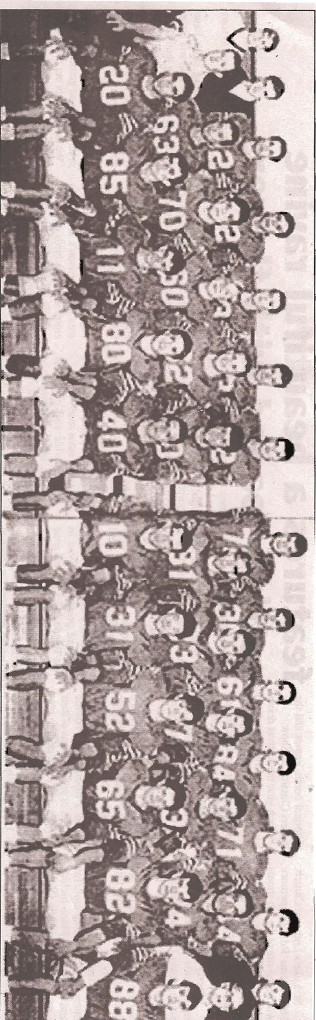
Bedford High School Football Team of 1966 (Graduating Class of 1967)