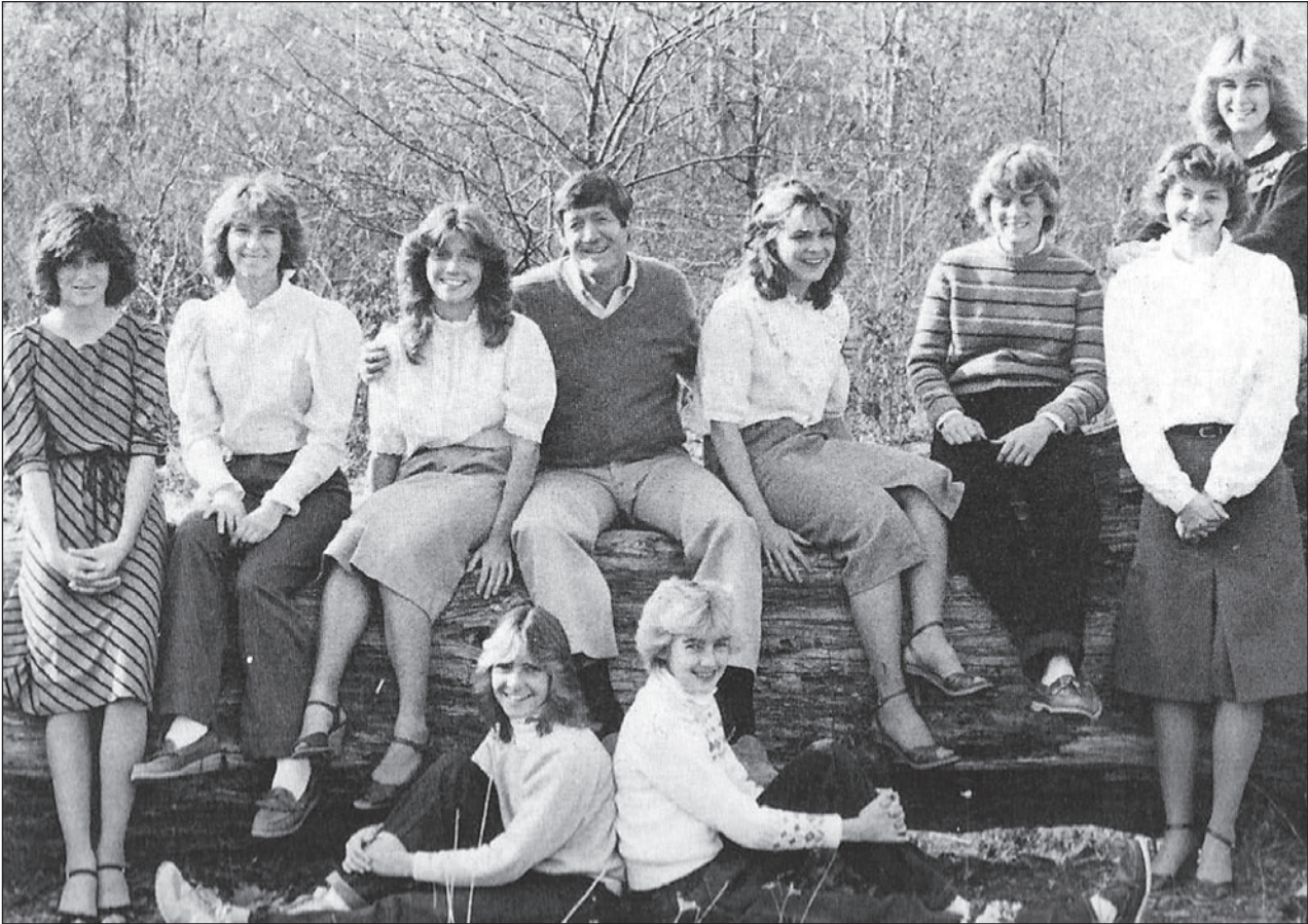
State Championship Girls Cross Country Team of 1982